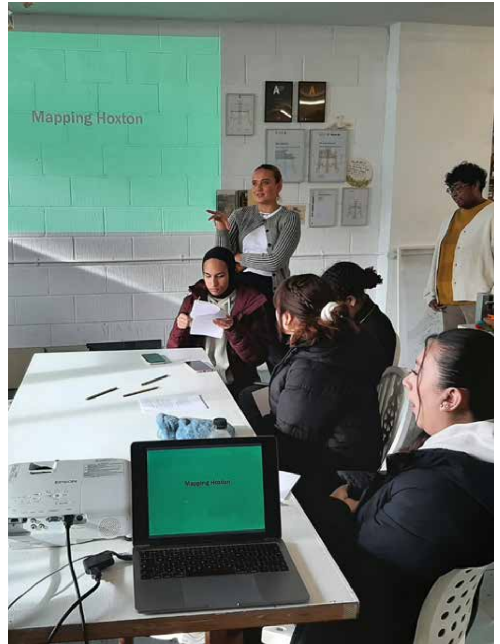
Hoxton Street Social Infrastructure Strategy